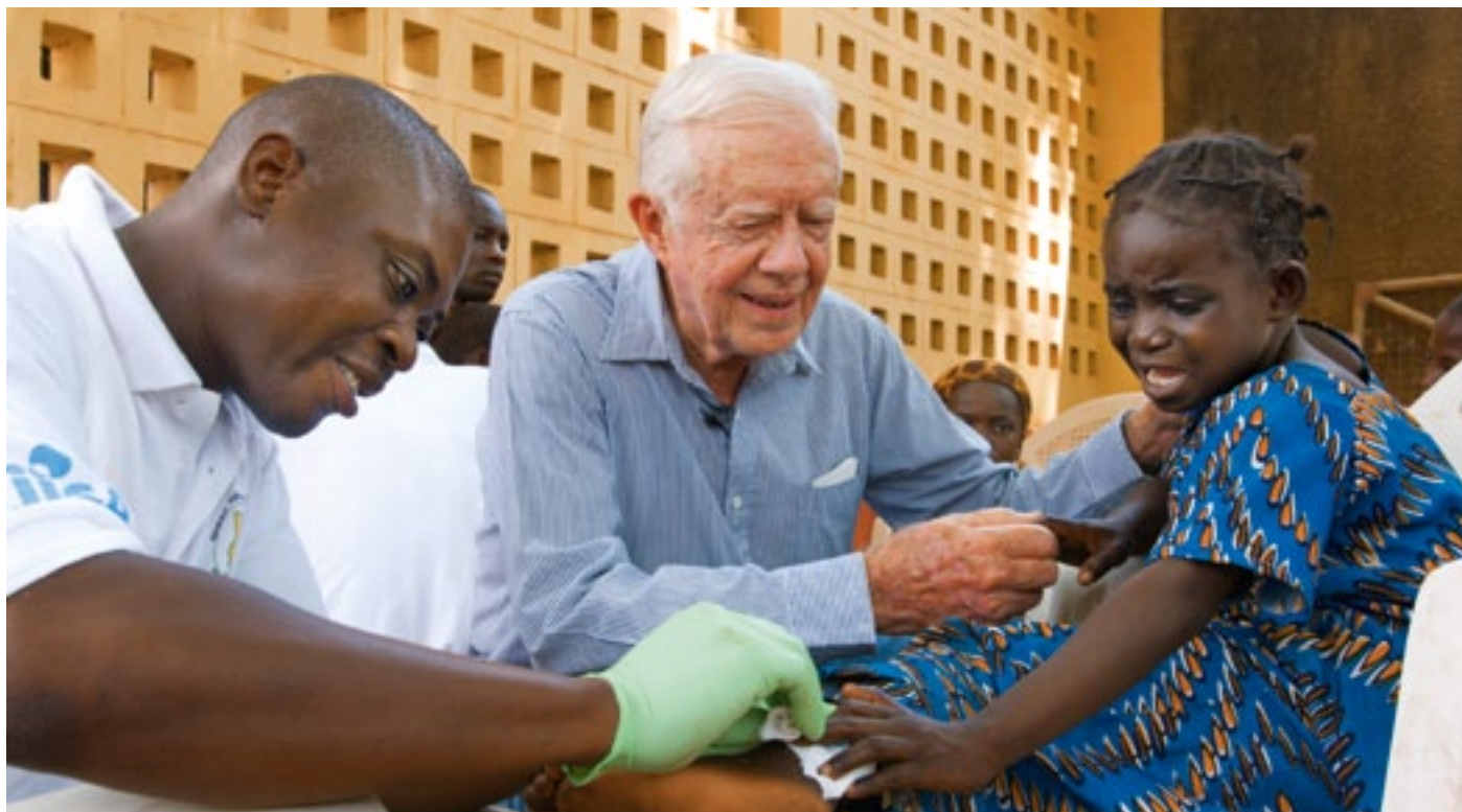
Above Former U.S. President Jimmy Carter tries to comfort a 6-year-old girl at a hospital in Ghana as a Carter Center volunteer dresses her extremely painful Guinea worm wound.