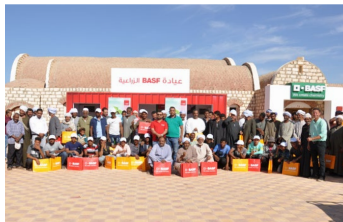
In collaboration with the Blue Moon organization, Esna, Luxor