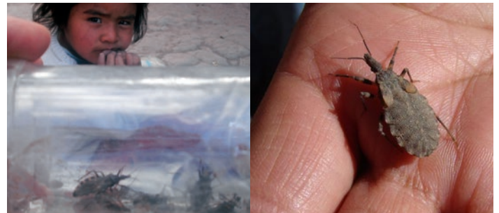
The insect that can cause Chagas, the so-called “kissing bug”.

In cooperation with the National Chagas Disease Program of the Argentinian Ministry of Health, BASF is not only supplying its product, Fendona® – an insecticide that can safely be sprayed inside homes – but importantly, key expertise and know-how.